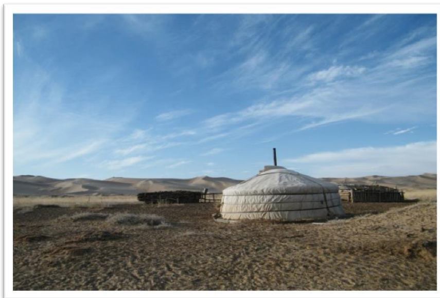
Yurt in Mongolia (Alex Mueller)

A yurt is the traditional dwelling of Central Asia nomads. Made to resist extreme climates, this circular shape abode has five basic elements: lattice walls, roof beams, a roof ring, a door, and a felt and hide covering. Since the 13th century, yurts have been used by nomadic horse herders as portable homes. It takes less than a day to deconstruct or set-up a yurt.